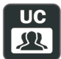
Hybrid UC Meeting