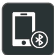
Pairing via Bluetooth