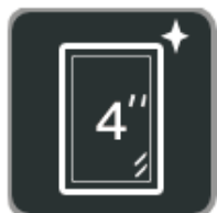
4" Multi-Touch Screen