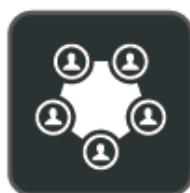
Yealink Pentagon Meeting Room