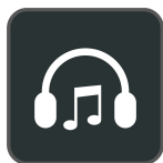
High-Quality Audio Experience