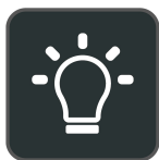
Dual Busylights for Fewer Interruptions