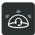
3-Mic & AI Noise Cancellation

Additionally, the UH46 features advanced three-microphone noise-canceling technology, delivering exceptional noise reduction performance. Whether you're in the office or working from home, the UH46 helps you stay focused and boosts your productivity.