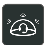
2-Mic & AI Noise Cancellation

The Yealink UH44 is a professional USB-wired headset that delivers outstanding audio performance and noise-canceling capabilities. Its superior design and comfortable materials ensure all-day comfort. Whether in the office or working from home, the UH44 helps you stay focused and enhances your productivity.